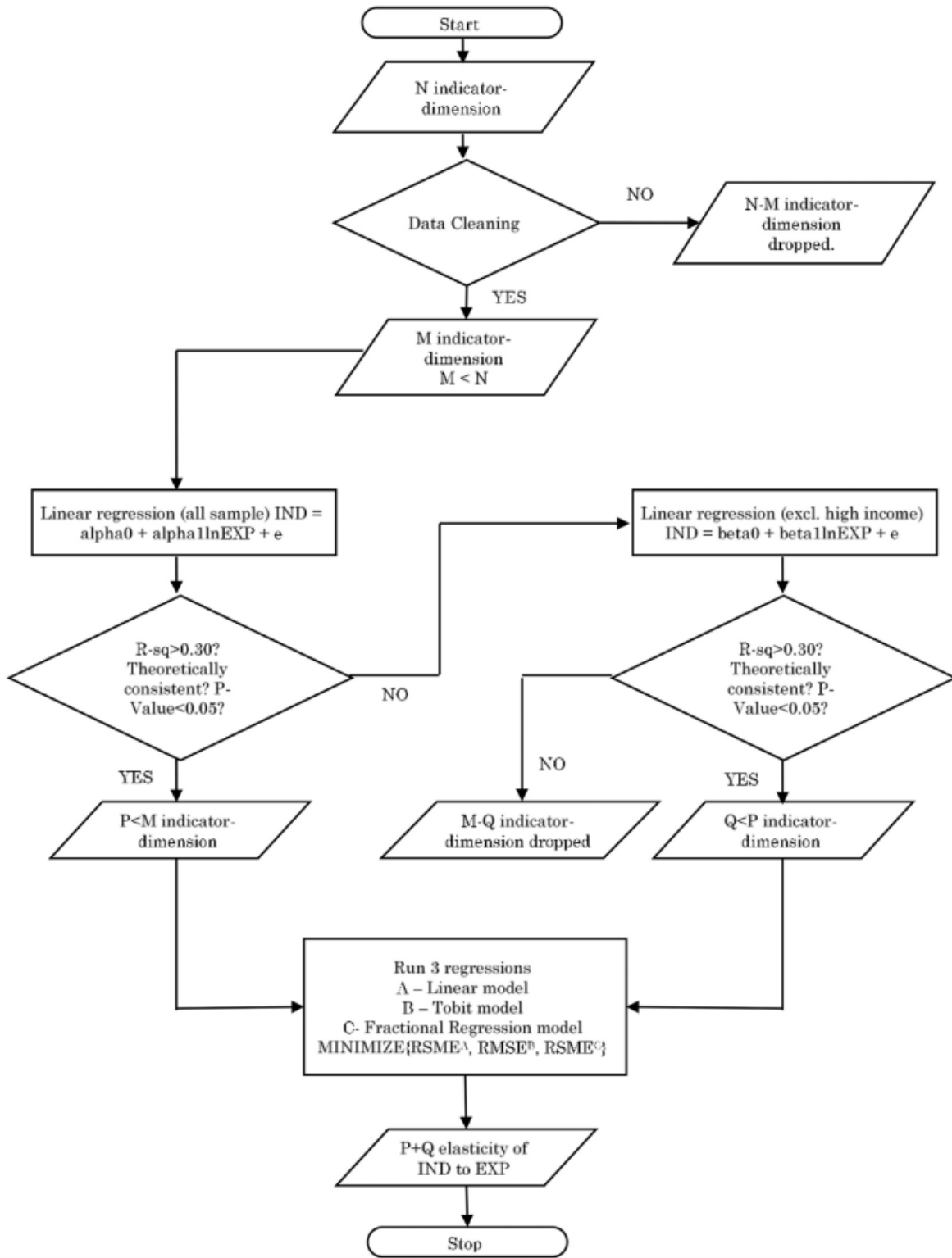
Fig. 1. Indicator and model selection protocol. Notes: This figure depicts the selection process of the indicator-series-dimension for the quantitative analysis with and without COVID-19 projections. The indicator-series-dimension (in this figure, shortened to indicator-dimension) is the combination of SDGs indicators with their sub-indicators (series) and dimensions (see notes on Table 1 for an example). N, M, P, and Q are the numbers of the indicator-series-dimension selected in each step. Only those that pass the three criteria (R-square > 0.30, theoretically consistent, and P-value < 5% level) can go through the next process for estimating the elasticity of the SDGs indicator of GNI per capita